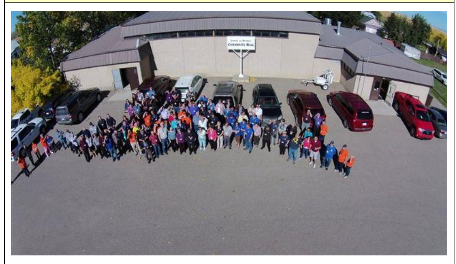
Photo of the attendees at the Workshop in Pincher Creek as taken by the RCMP remote helicopter under the controls of Cpl Barry Red Iron - Lethbridge RCMP Forensic Collision Reconstructionist.