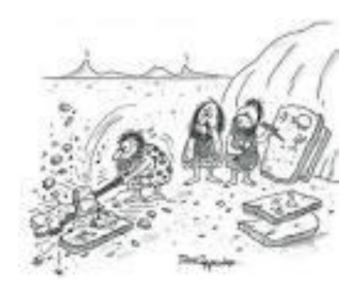
"He handles all our shredding"

Lethbridge: Lethbridge Mobile Shredding - 403-382-5181