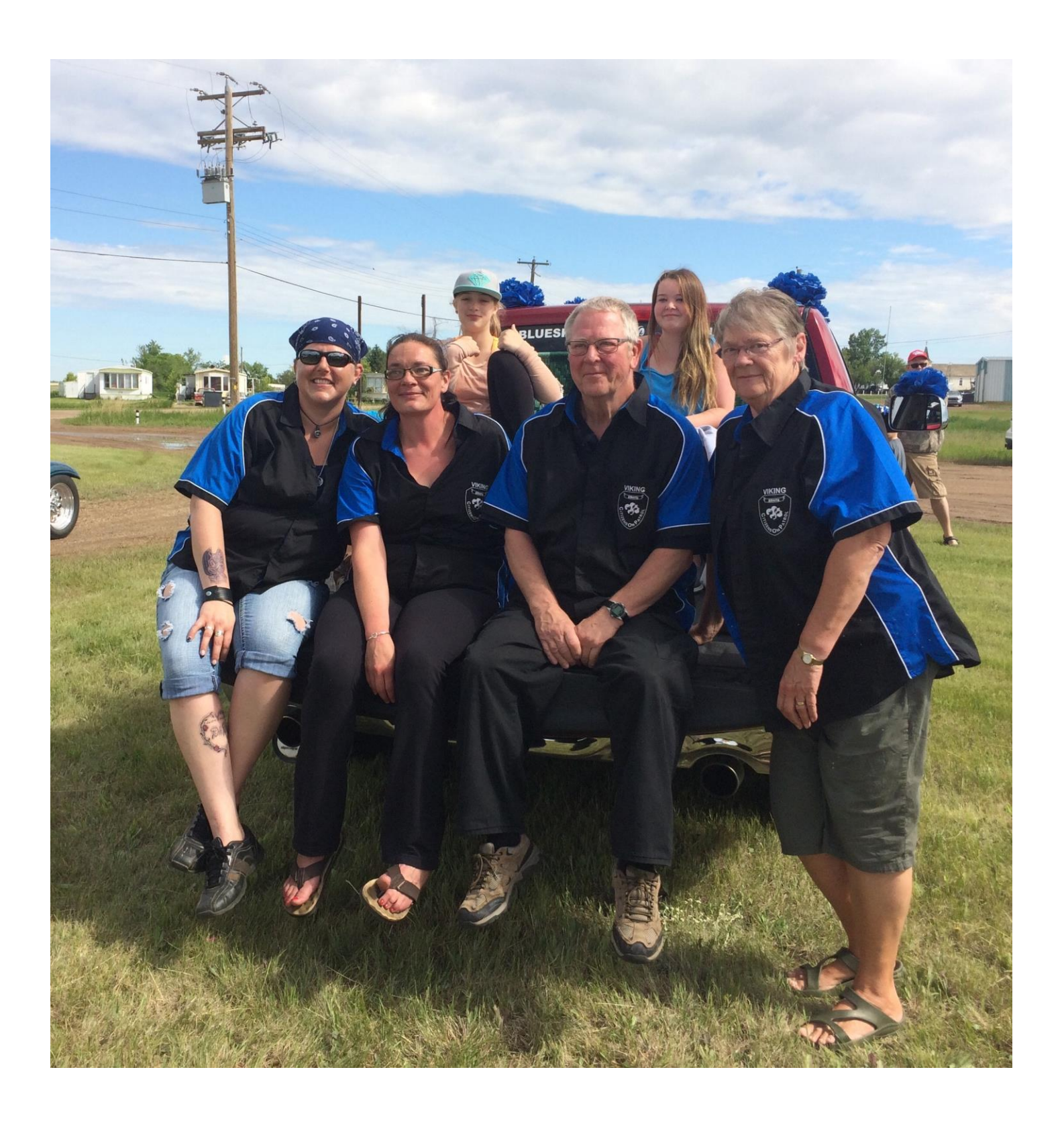
Viking C.O.P. members had a busy day volunteering and at the same time were being video graphed for the ACOPA video project.