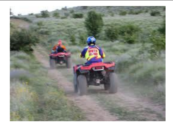
Citizens On Patrol Off-Road

Please send changes to your group contact to: <a href="mailto:president@acopa.ca">president@acopa.ca</a> so that all fan out emails get to your group.